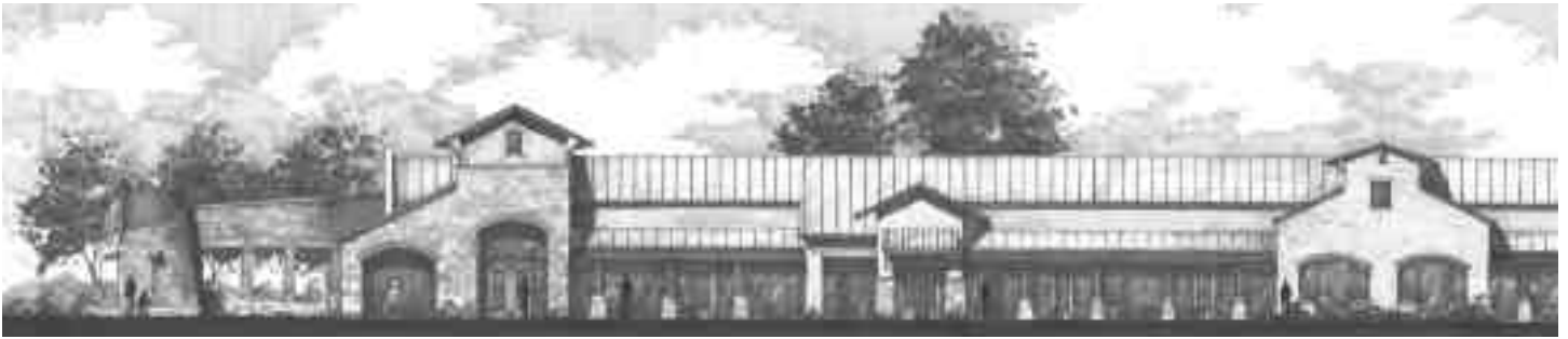
SCHEMATIC OF PHASE ONE, from Wm. Cannon Drive (FRONT VIEW)

ponds and park-like areas within the shops and restaurants. Outdoor seating areas were also on the agenda. Hedges will be planted between parking areas, so that cars will not be as visible from the streets. All of the buildings will have covered walkways, separating them from the parking areas.