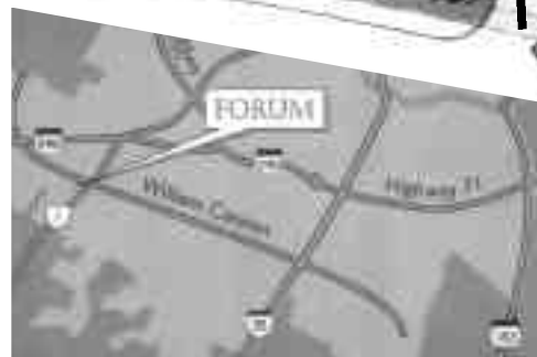
Above: SCHEMATIC OF PHASE ONE (TOP VIEW). Note the two entrances off Wm. Cannon Drive. Left: FORUM location map.